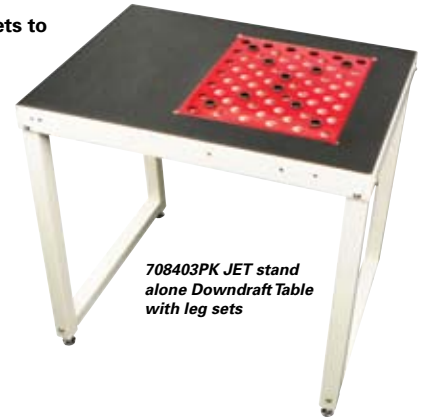
708403PK JET stand alone Downdraft Table with leg sets